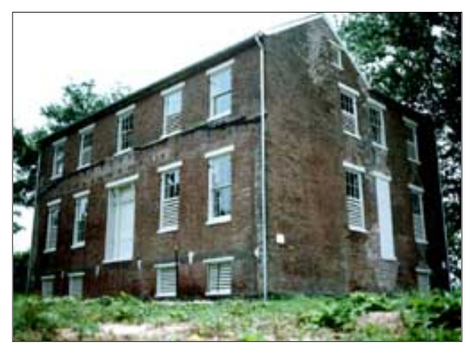
This building has been successfully mothballed for 10 years because the roof and walls were repaired and structurally stabilized, ventilation louvers added, and the property maintained.

When all means of finding a productive use for a historic building have been exhausted or when funds are not currently available to put a deteriorating structure into a useable condition, it may be necessary to close up the building temporarily to protect it from the weather as well as to secure it from vandalism. This process, known as mothballing, can be a necessary and effective means of protecting the building while planning the property's future, or raising money for a preservation, rehabilitation or restoration project. If a vacant property has been declared unsafe by building officials, stabilization and mothballing may be the only way to protect it from demolition.