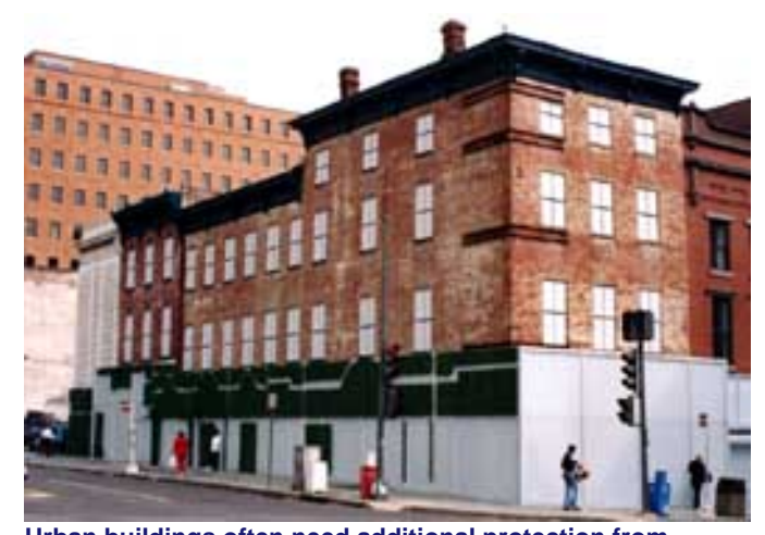
Urban buildings often need additional protection from unwanted entry and graffiti. This commercial building uses painted plywood panels to cover its glass storefronts. The upper windows on the street sides have been painted to resemble 19th century sash.

often be done by a local roofing contractor. If the roof is in poor condition, but the historic materials and configuration are important, a new temporary roof, such as a lightweight aluminum channel system over the existing, might be considered. If the roofing is so deteriorated that it must be replaced and a lightweight aluminum system is not affordable, various inexpensive options might be considered. These include covering the existing deteriorated roof with galvanized corrugated metal roofing panels, or 90 lb. rolled roofing, or a rubberized membrane (refer back to cover photo). These alternatives should leave as much of the historic sheathing and roofing in place as evidence for later preservation treatments.