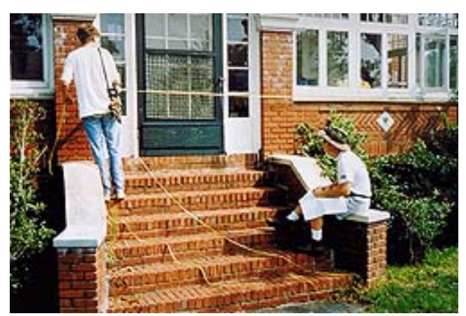
Documenting a building's history and assessing its condition provide information to set priorities for stabilization and repair, prior to mothballing.

Old photographs can be helpful in identifying early or original features that might be hidden under modern materials. On a walk-through, the architect, historian, or preservation specialist should identify the architecturally significant elements of the building, both inside and out.