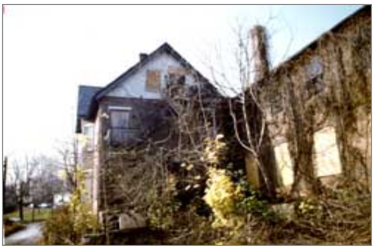
Boarding up without adequate ventilation and maintenance has accelerated deterioration of this property.

Comprehensive mothballing programs are generally expensive and may cost 10% or more of a modest rehabilitation budget. However, the money spent on well-planned protective measures will seem small when amortized over the life of the resource. Regardless of the location and condition of the property or the funding available, the following 9 steps are involved in properly mothballing a building: