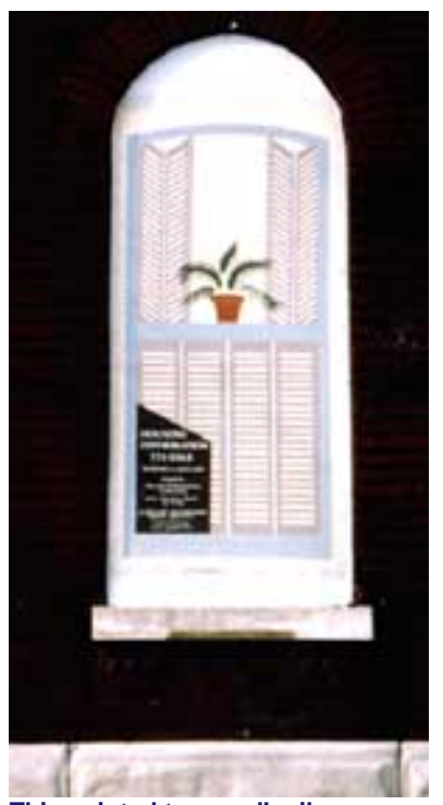
This painted trompe l'eoil scene on plywood panels is a neighborhood-friendly device.

to frame and sash. One common method is to bring the upper and lower sash of a double hung unit to the mid-point of the opening and then to install pre-cut plywood panels using long carriage bolts anchored into horizontal wooden bracing, or strong backs, on the inside face of the window. Another means is to build new wooden blocking frames set into deeply recessed openings, for example in an industrial mill or warehouse, and then to affix the plywood panel to the blocking frame. If sash must be removed prior to installing panels, they should be labeled and stored safely within the building.