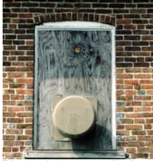
This exhaust fan has tamper-proof housing. Photo: Michael Mills, Ford Farewell Mills Gatsch, Architects.

There are four critical climate zones when looking at the type and amount of interior ventilation needed for a closed up building: hot and dry (southwestern states); cold and damp (Pacific northwest and northeastern states); temperate and burnid (Mid Atlantic states, pagetal areas); and but and burnid