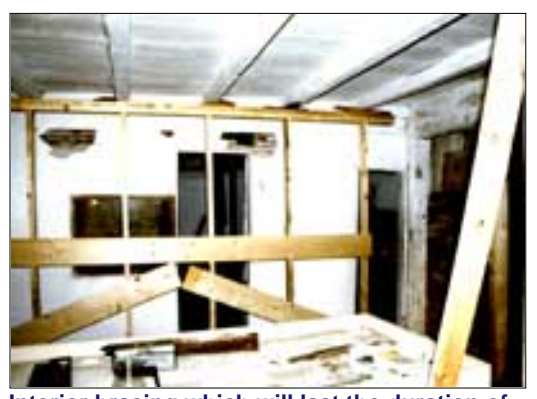
Interior bracing which will last the duration of the mothballing will protect weakened structural members.

Structural stabilization by a qualified contractor should be done under the direction of a structural engineer or a preservation specialist to ensure that the added weight of the reinforcement can be sustained by the building and that the new members do not harm historic finishes. Any major vertical post added during the stabilization should be properly supported and, if necessary, taken to the ground and underpinned.