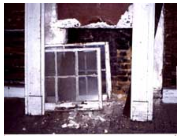
Loose or detached elements should be identified, tagged and stored, preferably on site.

in a room and then take a corner shot to get floor and ceiling portions in the picture. Photograph any unusual details as well as examples of each window and door type.