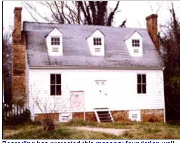
Regrading has protected this masonry foundation wall from excessive damp during its 10-year mothballing. Note the attic and basement vents, temporary stairs, and interpretive sign.

If the existing historic roof needs moderate repairs to make it last an additional ten years, then these repairs should be undertaken as a first priority. Replacing cracked or missing shingles and tiles, securing loose flashing, and reanchoring gutters and downspouts can