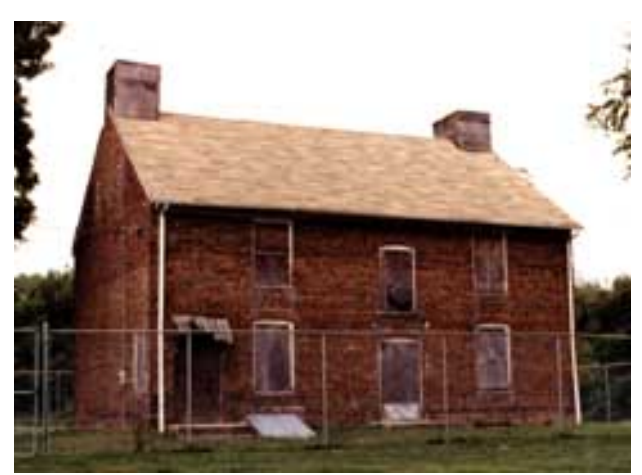
A view showing the exterior of the Brearley House, New Jersey, in its mothballed condition

There is some benefit from keeping windows unboarded if security is not a problem. The building will appear to be occupied, and the natural air leakage around the windows will assist in ventilating the interior. The presence of natural light will also help when periodic inspections are made. Rigid polycarbonate clear storm glazing panels may be placed on the window exterior to protect against glass breakage. Because the sun's ultraviolet rays can cause fading of floor finishes and wall surfaces, filtering pull shades or inexpensive curtains may be options for reducing this type of deterioration for significant interiors. Some acrylic sheeting comes with built-in ultraviolet filters.