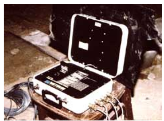
Portable monitors are used to record temperature and humidity conditions in historic buildings during mothballing.

Once closed up, a building interior will still be affected by the temperature and humidity of the exterior. Without proper ventilation, moisture from condensation may occur and cause damage by wetting plaster, peeling paint, staining woodwork, warping floors, and in some cases even causing freeze thaw damage to plaster. If moist conditions persist in a property, structural damage can result from rot or returning insects attracted to moist conditions. Poorly mothballed masonry buildings, particularly in damp and humid zones have been so damaged on the interior with just one year of unventilated closure that none of the interior finishes were salvageable when the buildings were rehabilitated.