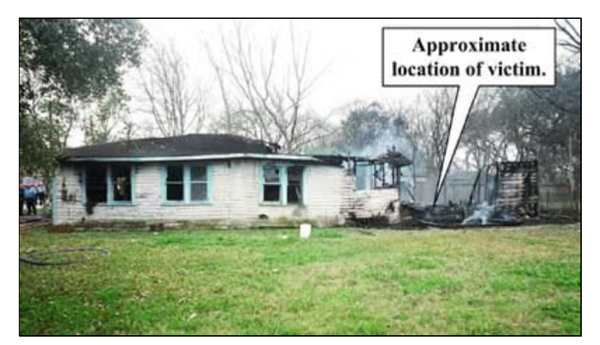
Photo 3. Note roof collapse area at rear of house.