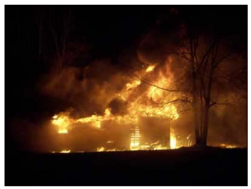
Photo 2. Taken just prior to, or near the time, of the collapse. See Photo 3 for the same view after fire extinguishment.