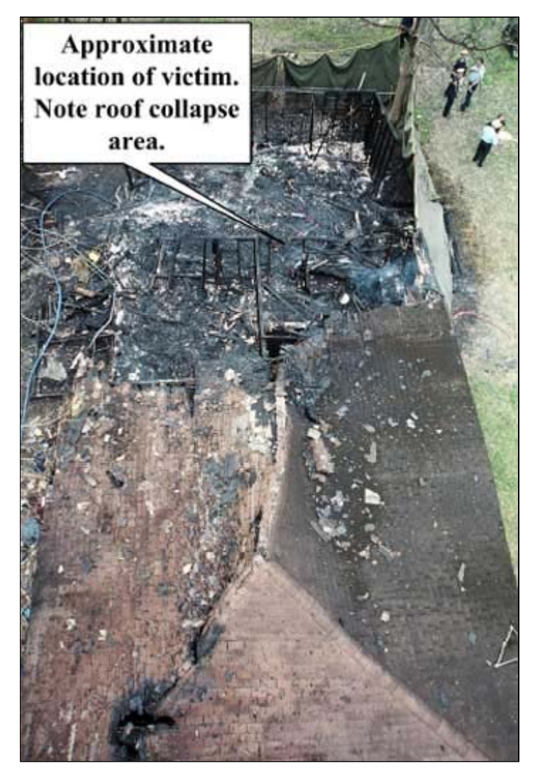
Photo 4. Aerial view of collapse zone.