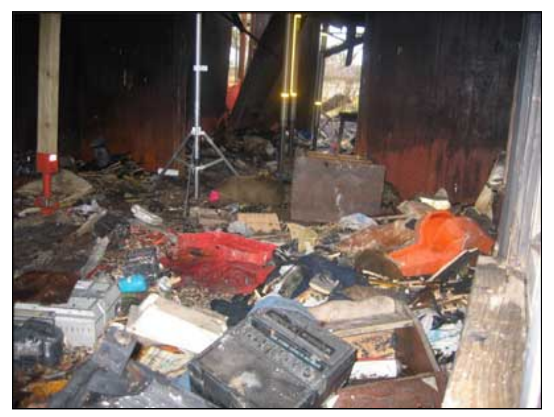
Photo 1. Note cluttered condition of floor in living room.