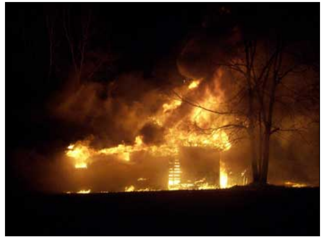
Photo 2. Taken just prior to, or near the time, of the collapse. See Photo 3 for the same view after fire extinguishment.