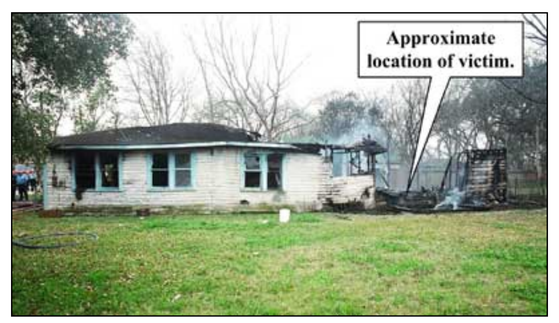
Photo 3. Note roof collapse area at rear of house.