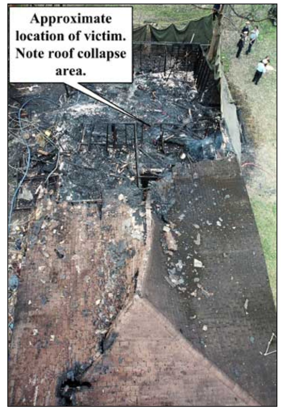
Photo 4. Aerial view of collapse zone.