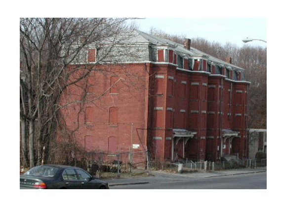
Owner: Responsive Uninhabited Secure