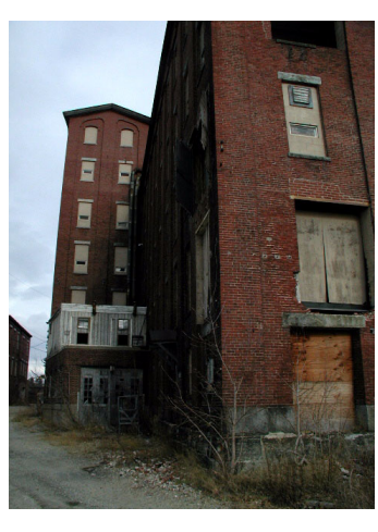
Owner: Absentee or Unknown Building Deteriorating Open to Unauthorized Entry