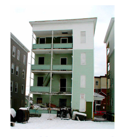
Owner: Unresponsive Uninhabited Open to Unauthorized Entry